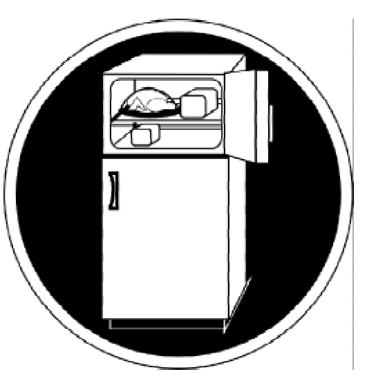
Figure 6.4: The electricity used by a two-door fridge may generate up to 1.5 tonnes of greenhouse gas and cost up to $180 per year.

The installation of a solar hot water system with a booster may reduce hot water energy usage. Every 200L of hot water used from an electric water heater uses about 6 kWh of electricity and generates about ten kilograms of greenhouse gases. Reducing heat losses from an electric storage water heater by wrapping the tank with extra insulation may save up to half a tonne of greenhouse gases and save $60 per year. In addition, many boiling water units are oversized. In most cases a five-litre unit is adequate, as it can supply 40 cups of hot water and recover temperature in a few minutes. Communal hot water systems should not be left on for 24 hours and over weekends.