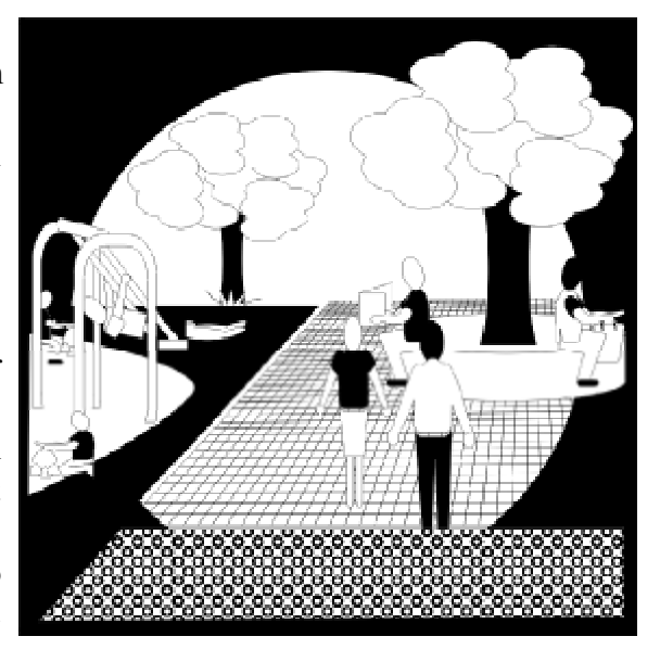
Figure 10.1: Pedestrianised space can offer safe environment for families.

In a recent paper published by the Worldwatch Institute, a Washington DC-based research organisation, author Michael Renner indicates that moves towards environmental sustainability have already generated an estimated 14 million jobs worldwide. He points out that numerous opportunities for job creation are emerging, ranging from recycling and remanufacturing of goods, to higher energy and materials efficiency and the development of renewable sources of energy.